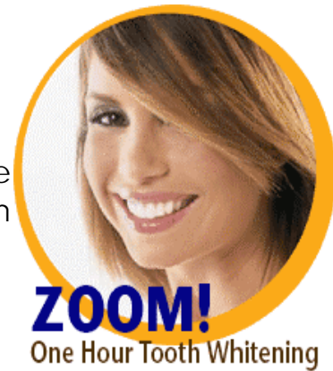
ZOOM! One Hour Tooth Whitening

Call our friendly receptionists to arrange a consultation appointment to discuss a new whiter smile for you this summer!